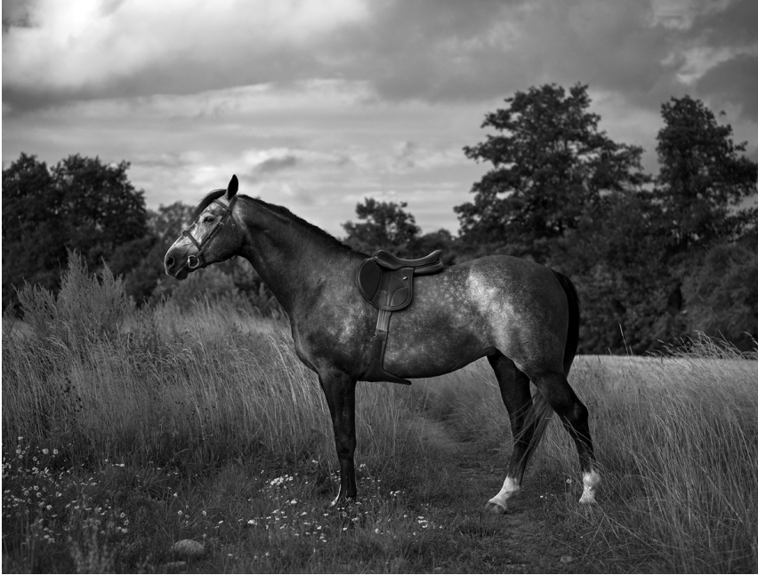
Stallion portrait with missing tack, 2021 Inkjet on Hahnemuhle Photo Rag Baryta paper 75 x 100 cm / edition of 12 plus 2 AP