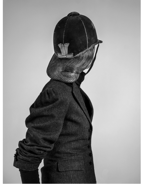
The Portrait, 2021 Inkjet on Hahnemuhle Photo Rag Baryta paper 100 x 75 cm / edition of 12 plus 2 AP