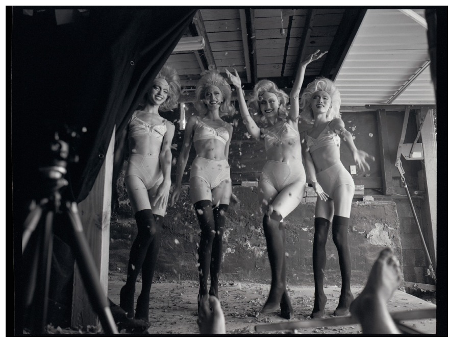
Ethyl Eichelberger Angels 2, 2019 Archival pigment print on rag baryta paper, mounted, framed with museum glass Available in three sizes, all within the same edition of 5 plus 1 AP

Instead, what Bailey-Gates invites us to do through A Glint in the Kindling is look without reaching for the terms we know. They invite us to simply look, unfettered by expectations or tradition. They invite us to look at bodies that joyfully drift between definitions, that find agency and poise where others find ambiguity and that are attuned to each individual and each moment. Objects, postures, relationships, clothes and actions we have been told are exclusive to a few are here reclaimed by anyone.